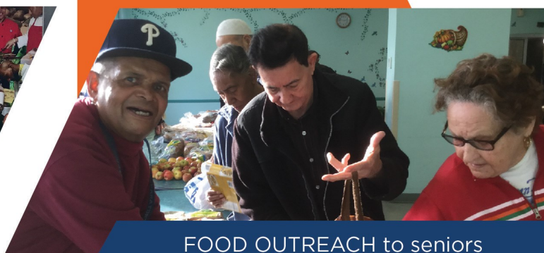
FOOD OUTREACH to seniors