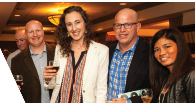
Harvest for Hunger 2017 - a record breaking year