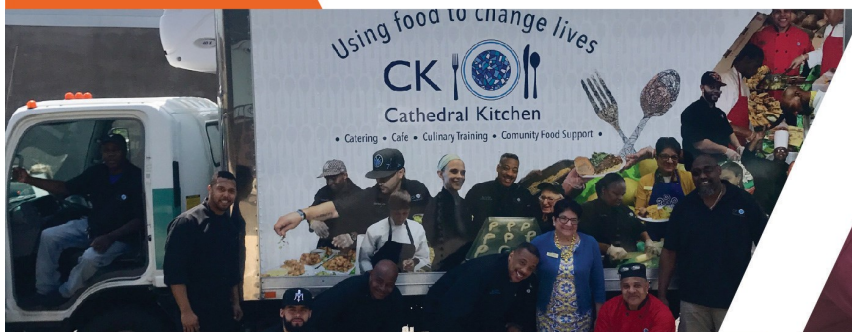
CK's NEW REFRIGERATED TRUCK picked up more than 468 donations last year