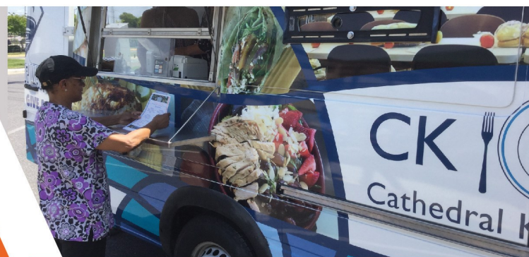
CK's SOUPER VAN - Buy a Meal, Give a Meal