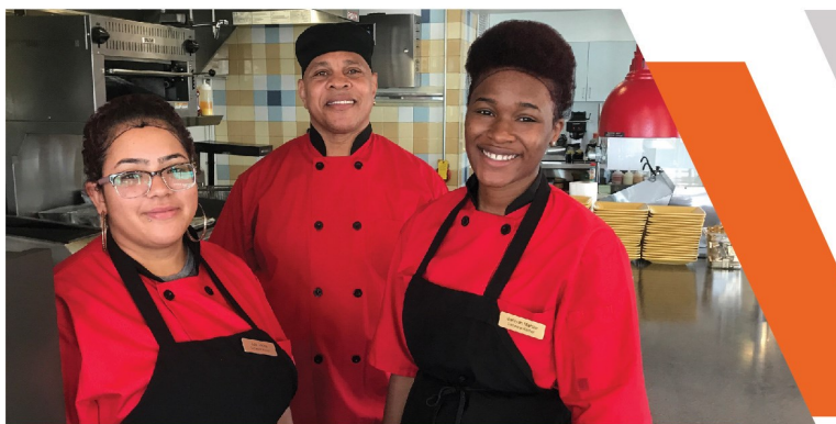
The CK Café - a popular lunch destination