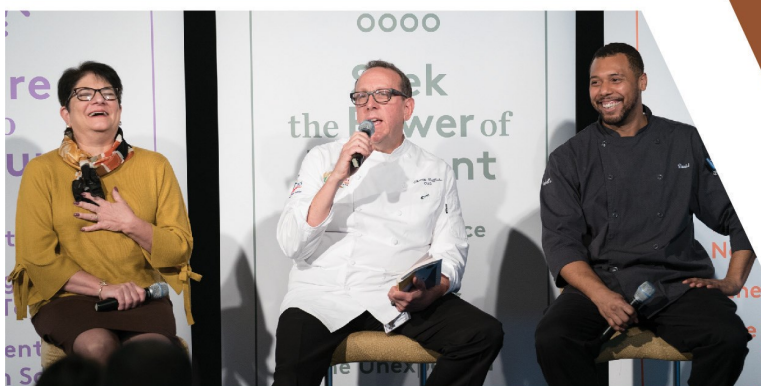
Hundreds of Corporate Partners